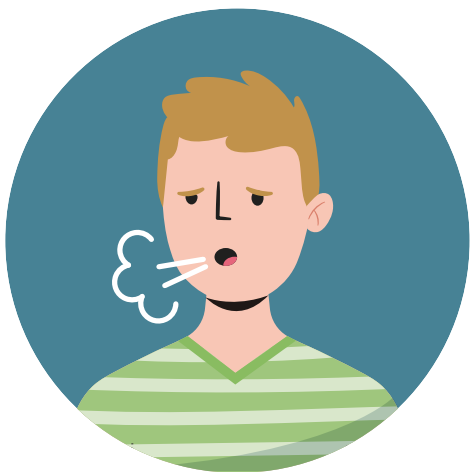
SHORTNESS OF BREATH OR DIFFICULTY BREATHING